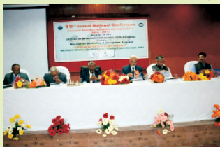
19th Annual Conference being held at SKUAST, Jammu

The society organizes annually in different parts of the country national / International conferences, which provide a vibrant platform for leading experts as well as upcoming young scientists and researchers to discuss, disseminate and exchange views on statistical issues, challenges and opportunities in view of the emerging areas of research in other sciences. Each such conference has a theme with many sub-themes. The deliberations during such conferences create opportunities for interaction between statisticians and subject matter specialists, who use statistics for their activities, which in turn open doors for collaborative studies for furtherance of science in emerging areas. The conferences are academically very enriching with very important and significant presentations made by scientists of international repute and eminence. Among many technical sessions organized, a technical session on