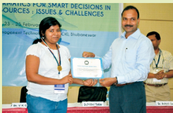
M.N. Das Memorial Young Scientist Award being given

In order to recognize excellence and originality of research work among talented young scientists who have shown extraordinary dedication towards their research programmes and to motivate them further, the society has started an annual “Young Scientist