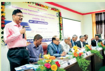
Keynote address being delivered during the 21st Annual Conference at Tirupati

Financial Statistics has been introduced since 2017 in which delegates from Reserve Bank of India (RBI), Securities and Exchange Board of India (SEBI), National Bank for Agriculture and Rural Development (NABARD), Ministry of Statistics and Programme Implementation (MoSPI), Indian Institute of Technology (IIT), etc. make presentations. One of the conferences had Farmers-Scientists interaction, where large number of farmers raised many issues concerning their farming practices and the experts satisfactorily answered the farmers' concerns and questions. So far twenty-one annual conferences have been organized in different universities / institutes of the country. The first conference was held at CCS Haryana Agricultural University, Hisar in 1998. The 21st conference was held at S.V. Agricultural College, ANGRAU, Tirupati in 2019.